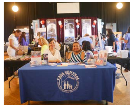
Community Health Expo 2019