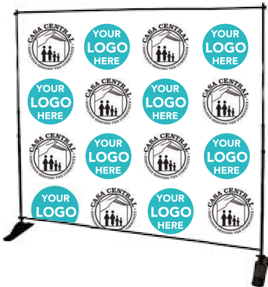
STEP AND REPEAT