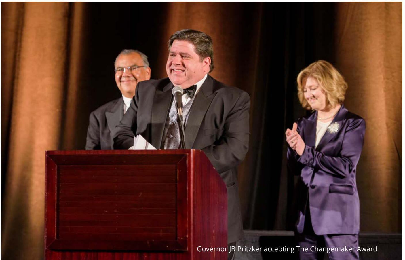
Governor JB Pritzker accepting The Changemaker Award