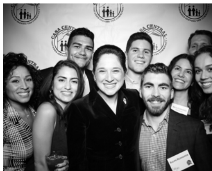
Networking Reception 2019