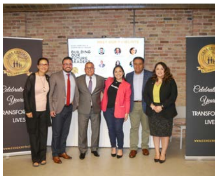
Community Forum 2019