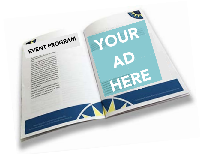
PROGRAM BOOKLET CASA CENTRAL'S EVENTS