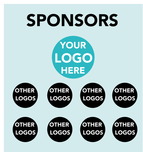
ALL DIGITAL AND PRINT MATERIALS