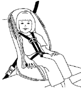
Step 2: Forward Facing 2-7 years old or longer