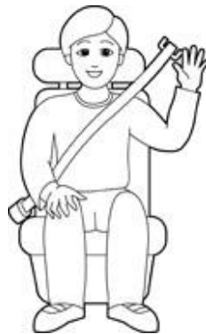
Step 4: Seat Belt /8 – Adult Typically at 4'9" in height