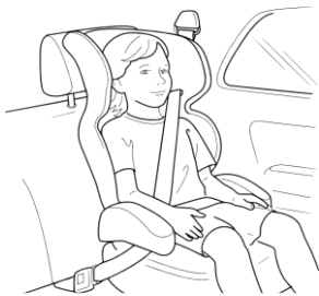
Step 3: Booster Seat 4-12 years old